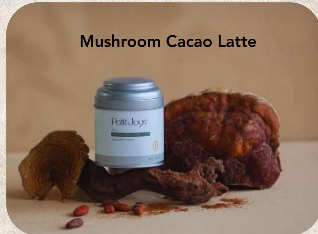
Mushroom Cacao Latte