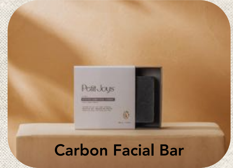
Carbon Facial Bar