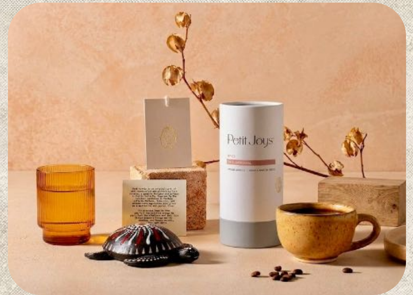
#C11 - The Milestone Gift