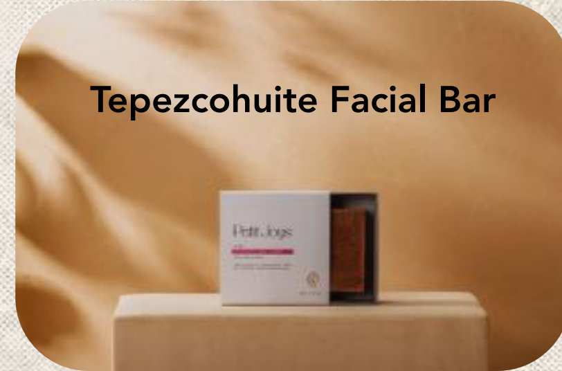
Tepezcohuite Facial Bar