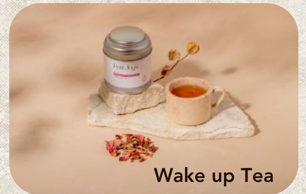
Wake up Tea